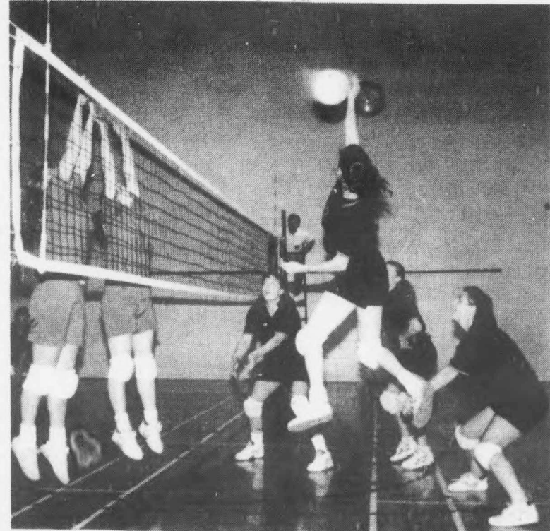
UNB Lady Reds in volleyball action last weekend in Moncton.