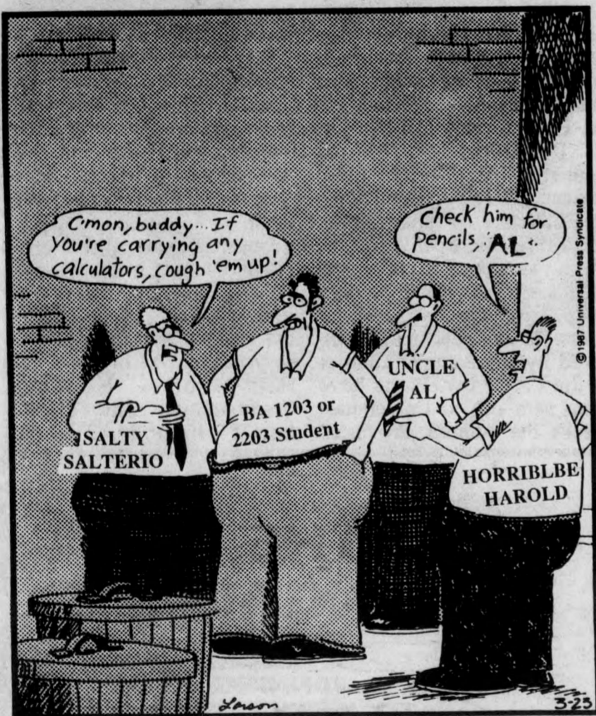
Accountant street gangs