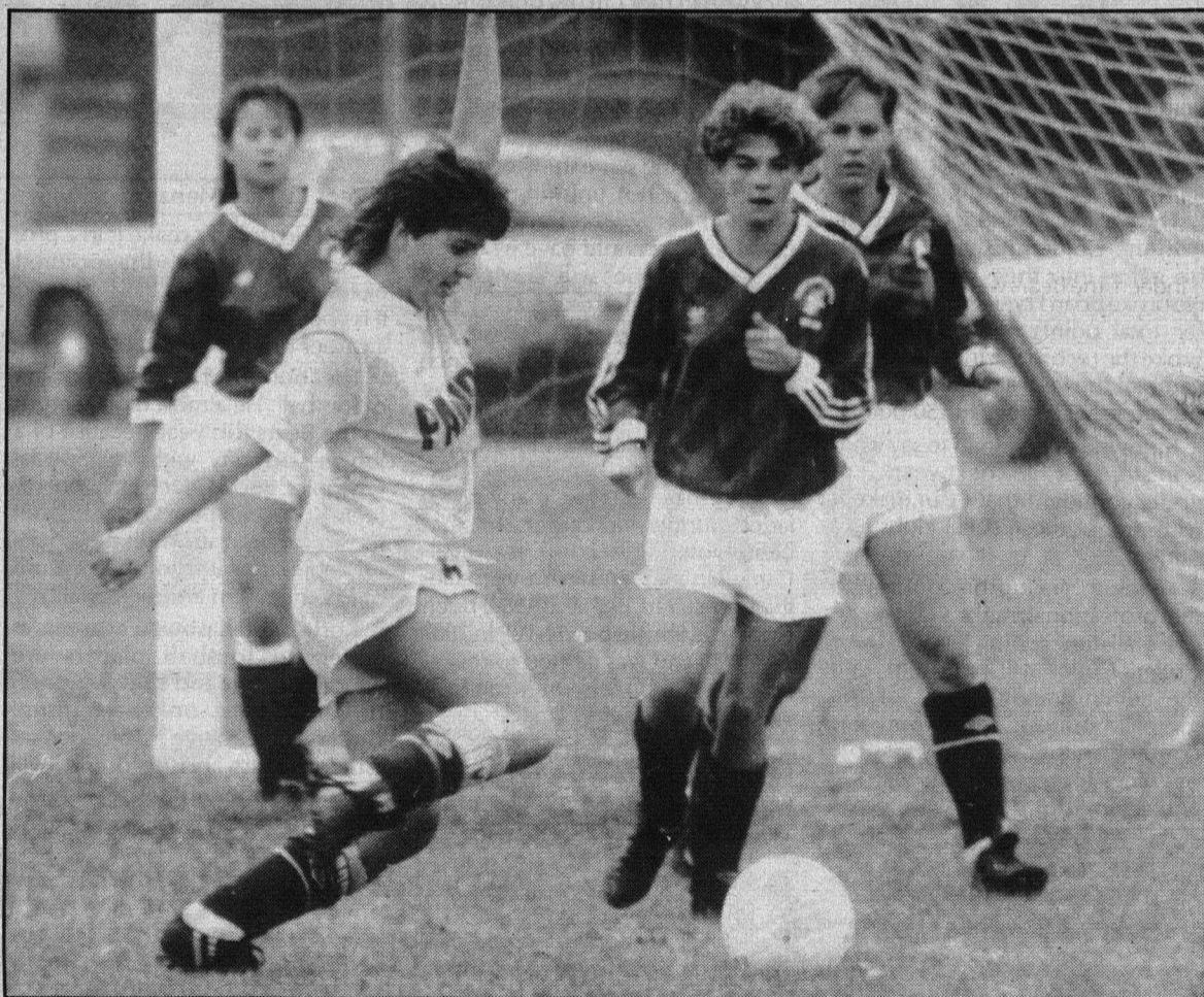
The Panda soccer squad squeezed by UBC 1-0 to move closer to the CIAU championships.