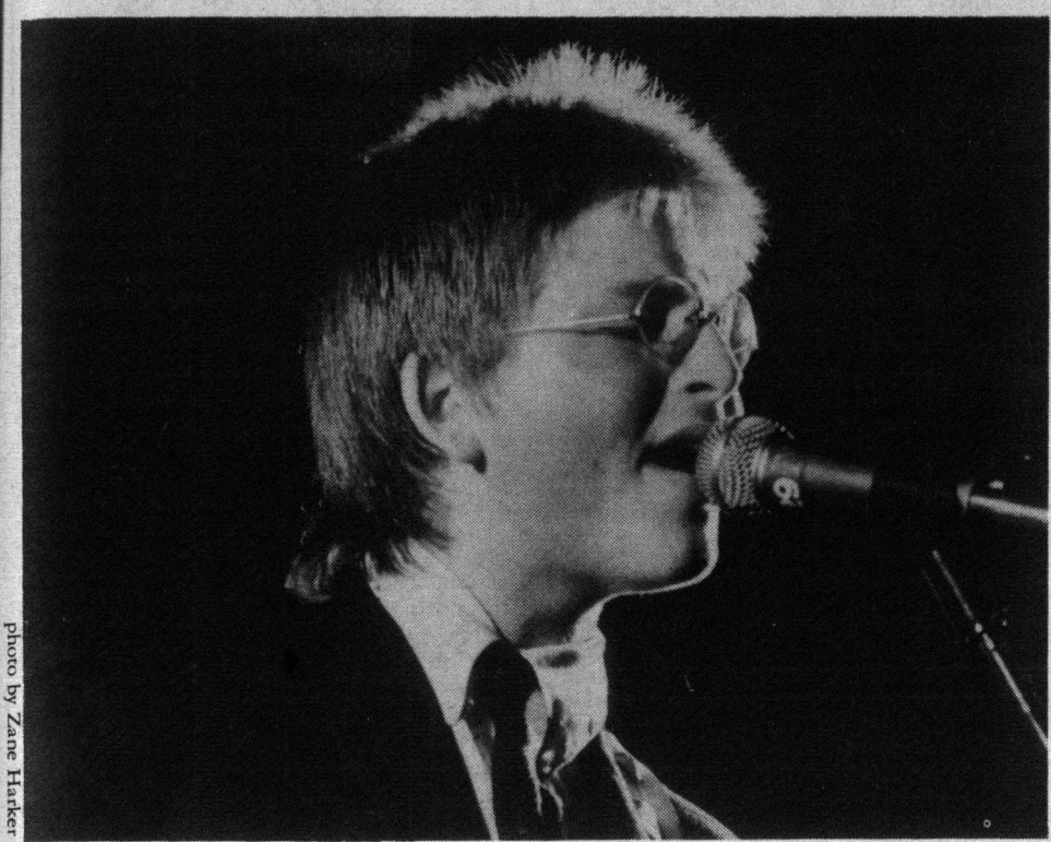
Lead singer of the Mods, a band on the move