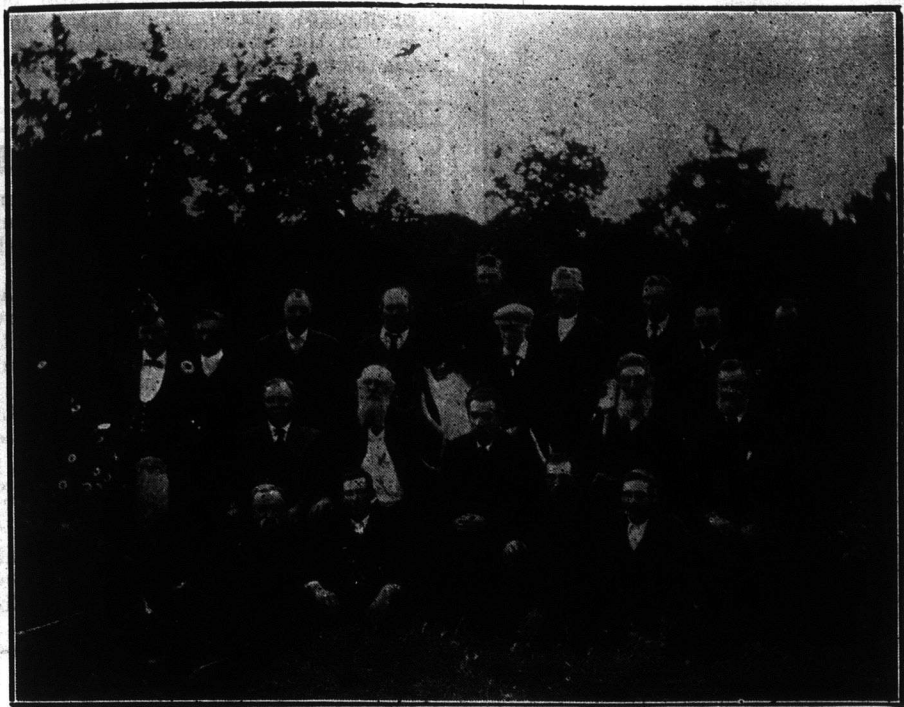
Old Gentlemen's Re-union, Pioneers of 1882 of Fleming District.

NOT to the statesman, soldier or Dreadnought alone belong the credit of the preservation of the British Empire and the extension of its boundaries. The stalwart pioneers whose energy and perseverance brought Western Canada into the family of nations and made it the granary of the Empire can surely be called Empire Builders and Preservers.