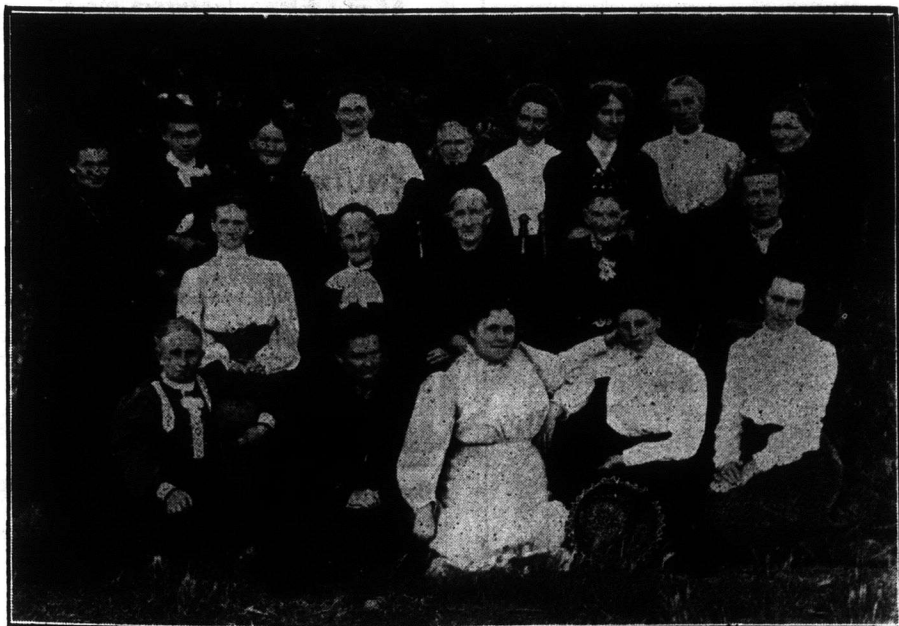
Ladies' Re-union, Pioneers of 1882 of Fleming Dist.