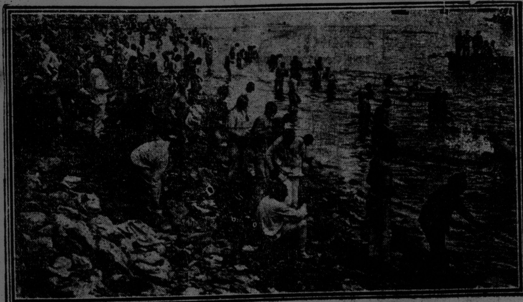
Another large force of Russians arrived at Brest, France, recently to reinforce the Russian lines already established in the Champagne district. Picture shows them enjoying a bath after their long journey.