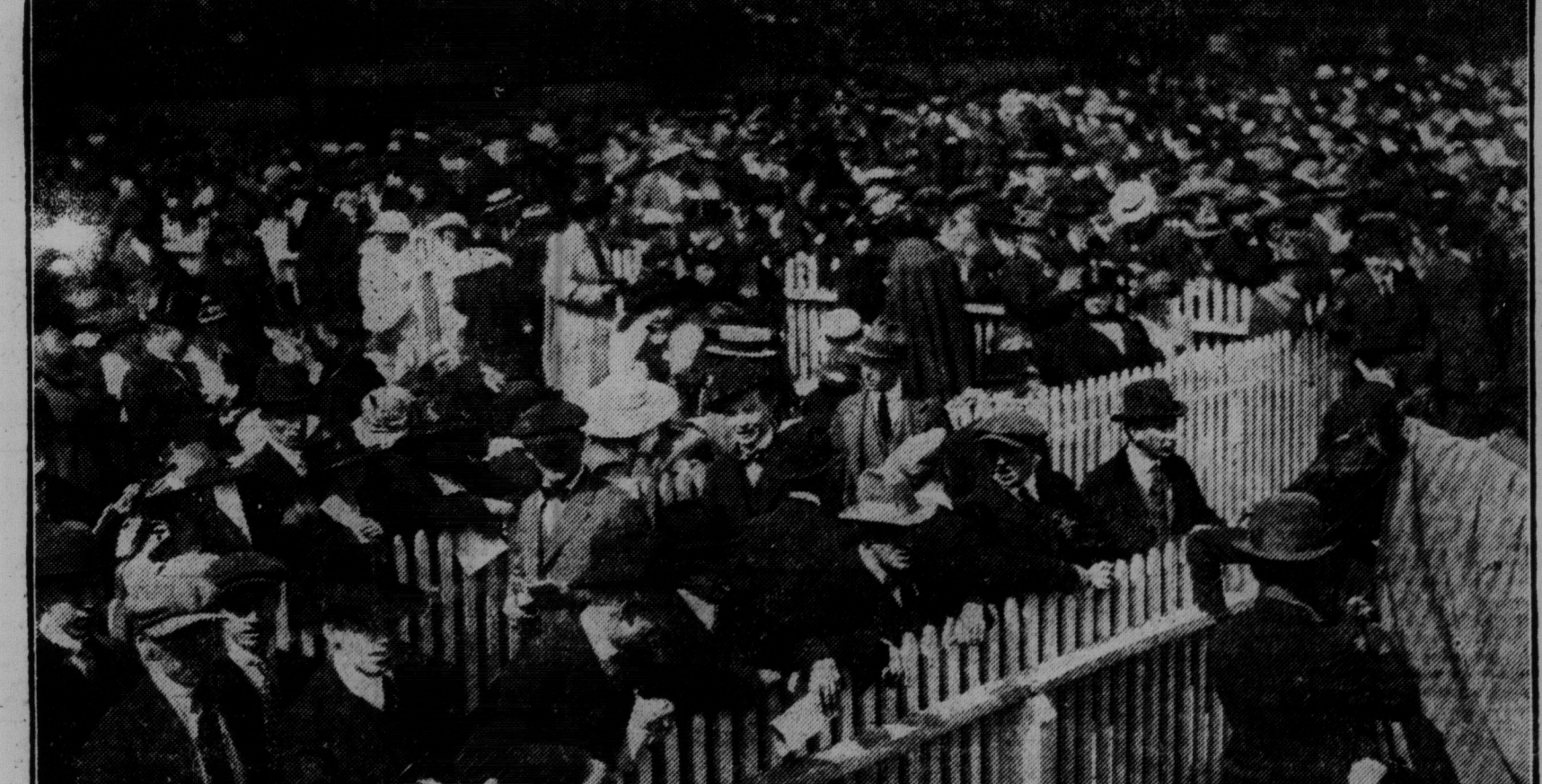
A PART OF THE CROWD OF TWENTY THOUSAND AT THE WOODBINE ON SATURDAY.

We all look forward to a holiday—and there are none that will enjoy it more than the help in Dineen's store—from the office boy to the department managers, all are set free to enjoy themselves in the open air today. Tomorrow, Tuesday, Dineen's will be ready with all their new stock of summer hats, panamas, straws, light felts—come in and see them—they are different from the ordinary kind. Dineen's Store is 140 Youge street.