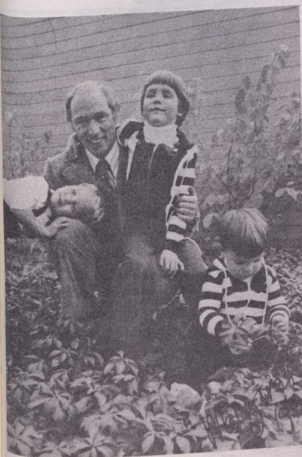
Michel, Sacha, Justin at Pierre E. Trudeau

The Prime Minister's Christmas card shows him with his children, Sacha, Justin and Michel. The photo was taken recently by Mrs. Trudeau.