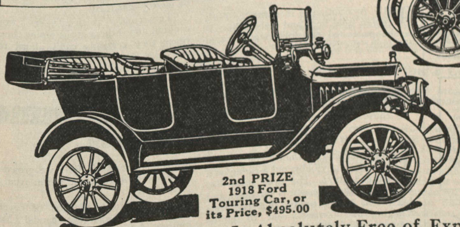
2nd PRIZE 1918 Ford Touring Car, or its Price, $495.00