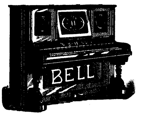
For Catalogues, etc., address