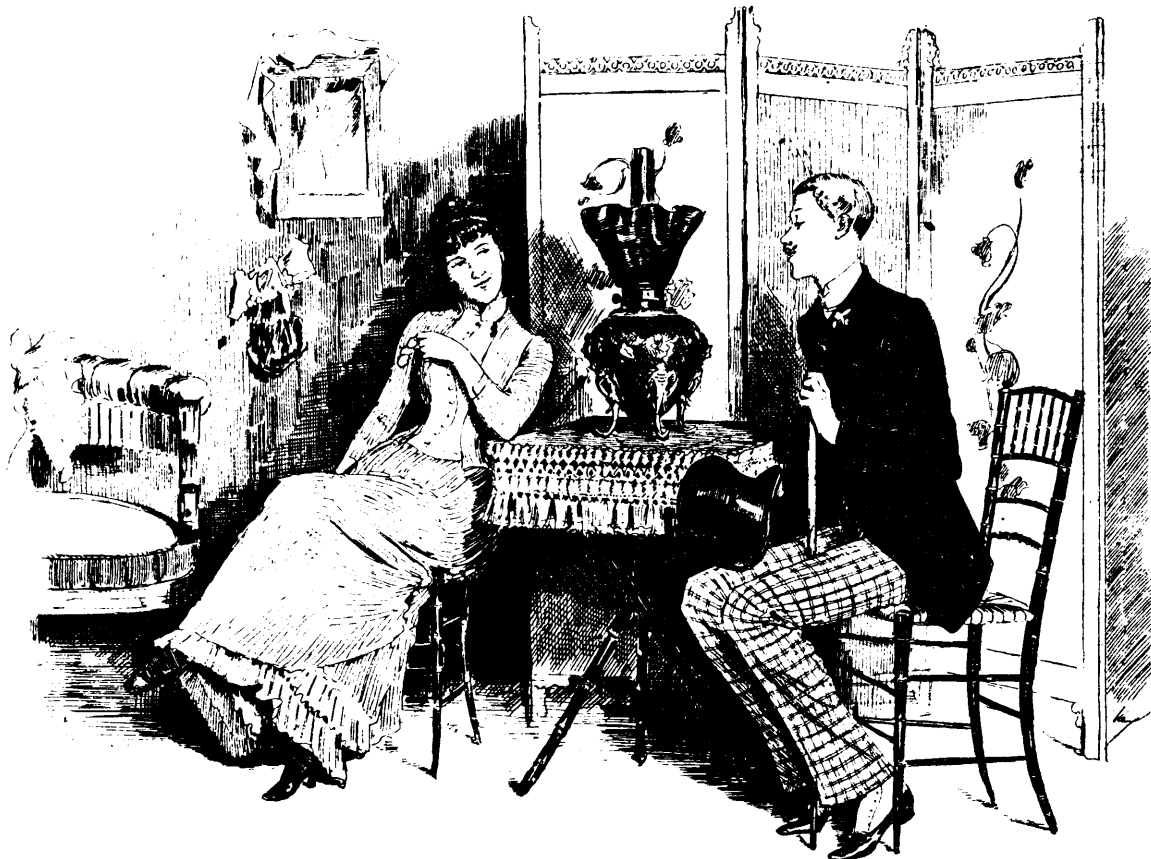
NOT GIVEN TO FLATTERY.

MR. FILLUP SCRIBBLER: Ah, yes, Madame, I do much writing; but then, you know, I have a very low estimate of my own work. MRS. FAYREEDER: Of course, you ought to have.