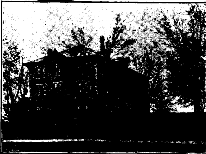
"Glen Mawr," MISS VEALS' SCHOOL

COR. SPADINA AVE. & MORRIS ST., TORONTO. PUPILS PREPARED FOR THE UNIVERSITIES.