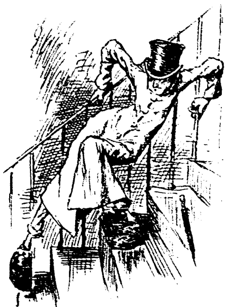
"GUESS IF I'M CAREFUL I'LL GET ALONG."