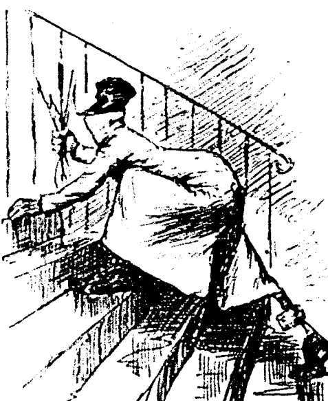
"IF EVER I GO OUT ON A DAY LIKE THIS AGAIN—"