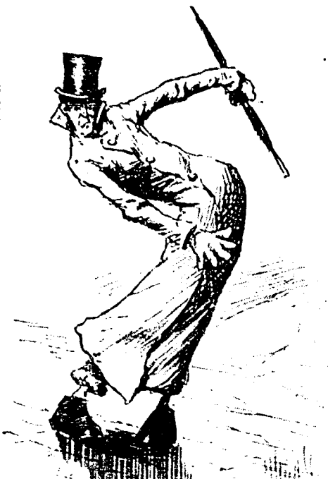
"OH, HANG THESE SLANTING PAVEMENTS!"