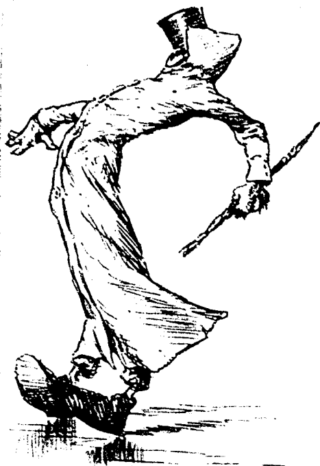
"BY JOVE! IT IS SLIPPERY."