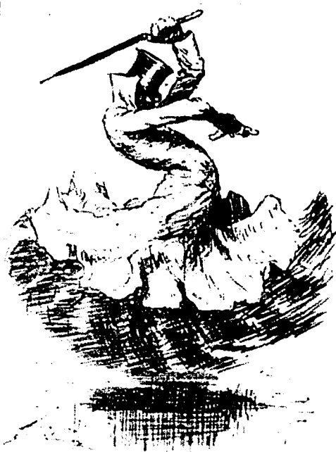
"A MAN DOES HAVE TO HAVE COMMAND OF HIS FEET ON THESE BAD SPOTS."