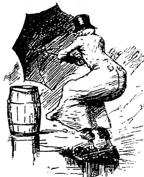
"HAPPY THOUGHT! WHAT'S THE USE OF WALKING?"