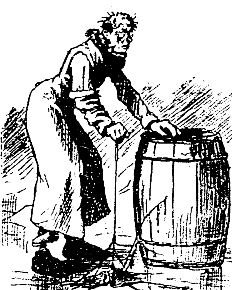
"IT'S A MIGHTY HARD WINTER, ANYHOW."