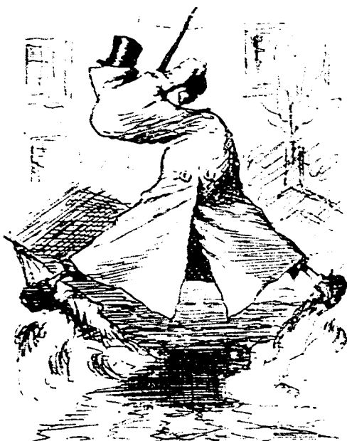
"STEADY DOES IT!"