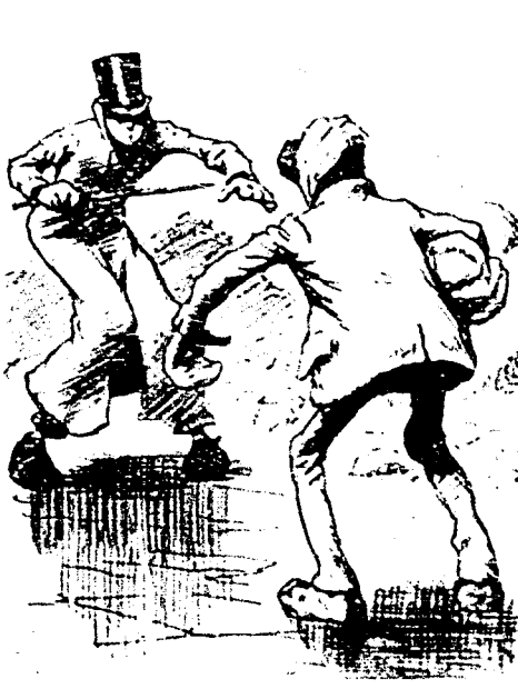
"NOW WHICH WAY IS HE COMING, ANYHOW?"