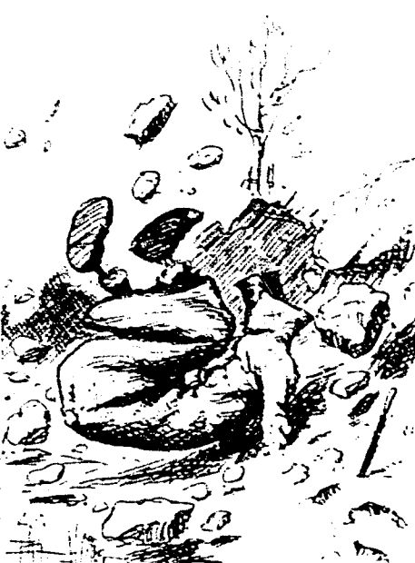
"OH DEAR ME! I HOPE NO ONE IS LOOKING!"