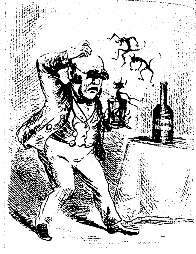
3. He makes some extraordinary discoveries in his whiskey.