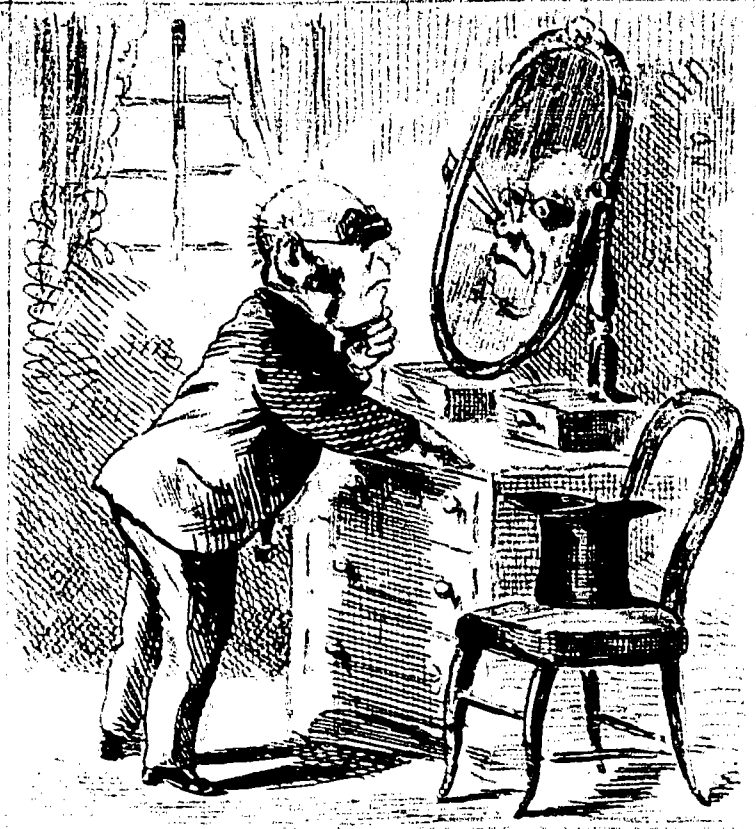
2. He examines his nose as reflected in the mirror.