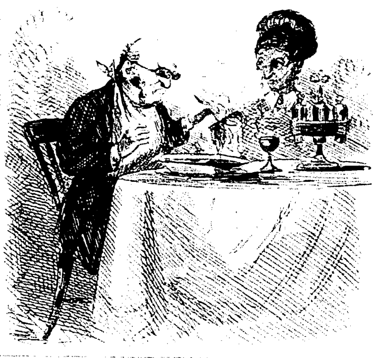
But still more at the appearances in his soup;