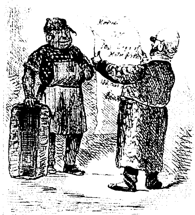
6. Is totally overcome by the tremendous magnitude of his butchers bill.