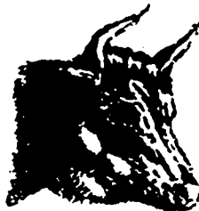
Trade Mark Reg'd.

Lump Jaw has heretofore baffled treatment. It has infected herds and pastures, and caused loss of hundreds of thousands of dollars. This new remedy cures quickly, thoroughly, and permanently. Leaves jaw smooth and sound. Easy to apply; costs but a trifle compared with results.