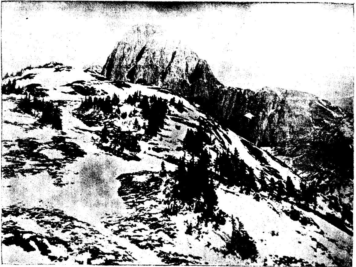
The Great Lime Dyke, Trout Lake District.