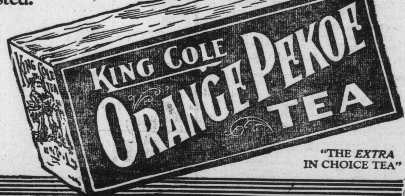
"THE EXTRA IN CHOICE TEA"