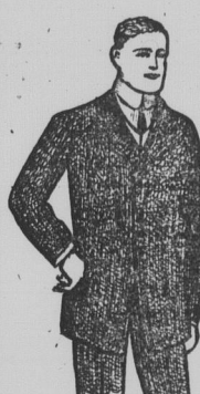
appearance. We are selling them at Bargain Prices.

YOUR OVER-COAT is your most displayed article of Clothing in the Winter months. You therefore need in it that quality touch in material, cut and finish which is distinctive of our line.