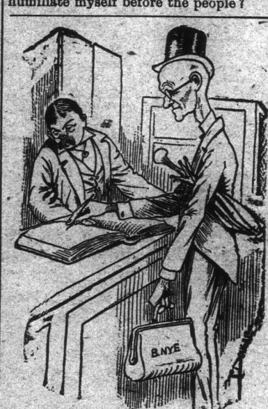
ANY RELATION TO BILL NYE?

prominent lecturers of the country, and gight dollars was all he asked. Why did I try to save eight dollars and thereby humiliate myself before the people?