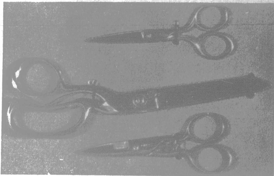
SET SCISSORS.—One self-sharpening scissors, one embroidery scissors, one buttonhole scissors—will cut buttonhole any size. All good quality steel. For only One New Subscriber to The Farmer's Advocate. Must be sent by present subscriber.