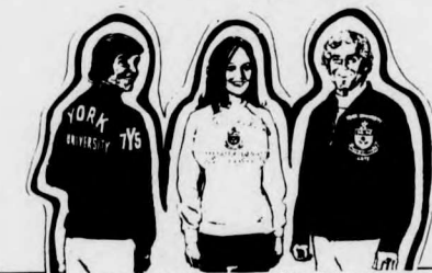
Hundreds of Poplin, Nylon, Leather, Melton, Corduroy Jackets, Slacks & Sweats & T Shirts

Rental Locators 4854 Yonge Street 222-5491