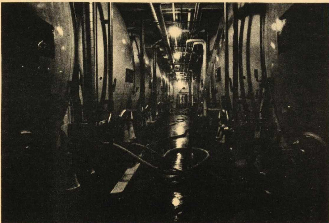
The beer matures in giant, cool, glass-lined tanks.