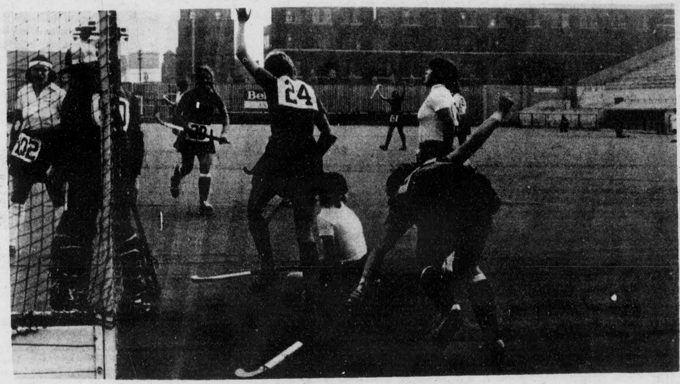
Jubulation following a Red Sticks goal

The Saturday Morning game against the University of Manitoba Bisonettes could have more appropriately been renamed the