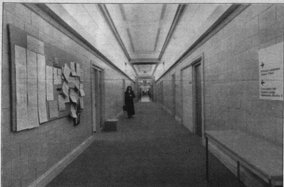
The new old Arts Building — after renovations, better than 1914.

Other universities competing in the competition this year included Carleton, Lakehead, McGill, Memorial, Mt. Allison, New Brunswick, Queen's, Regina, Ryerson, Saskatchewan, Windsor, and UBC.