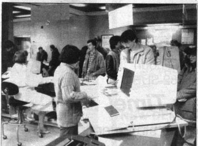
The scramble to drop a course — now you only get two chances.