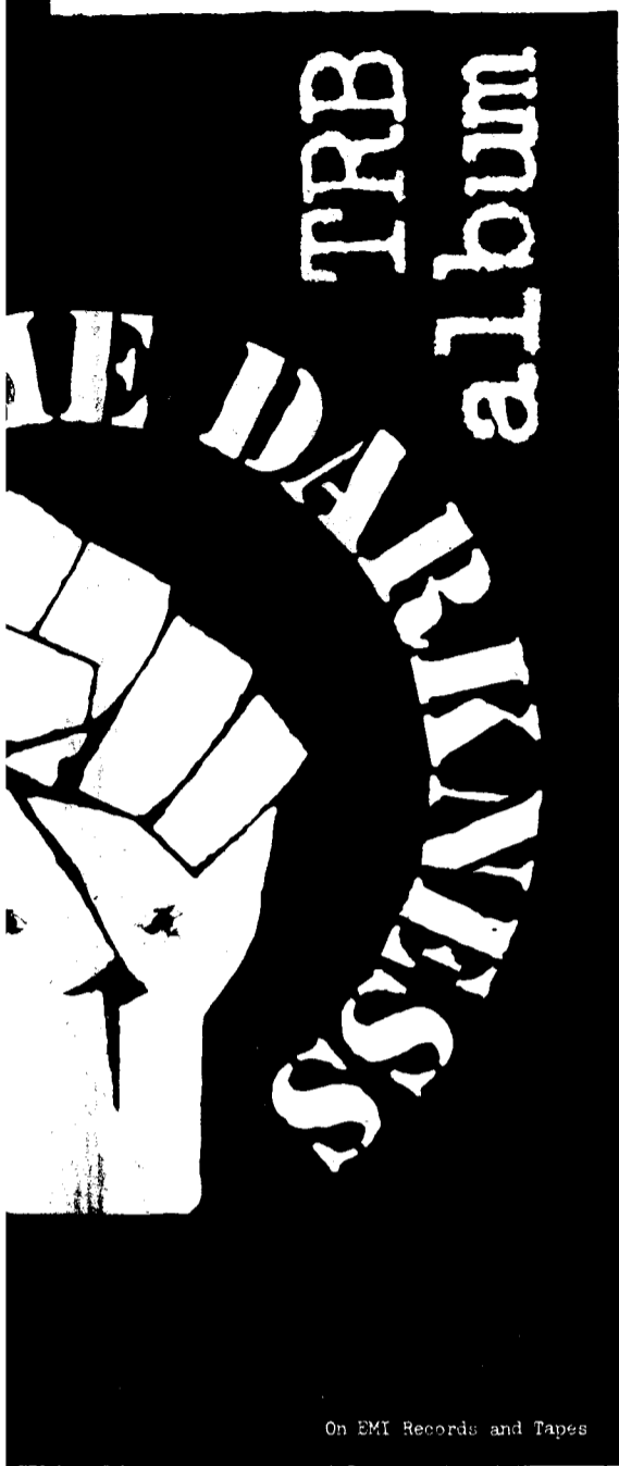
On EMI Records and Tapes