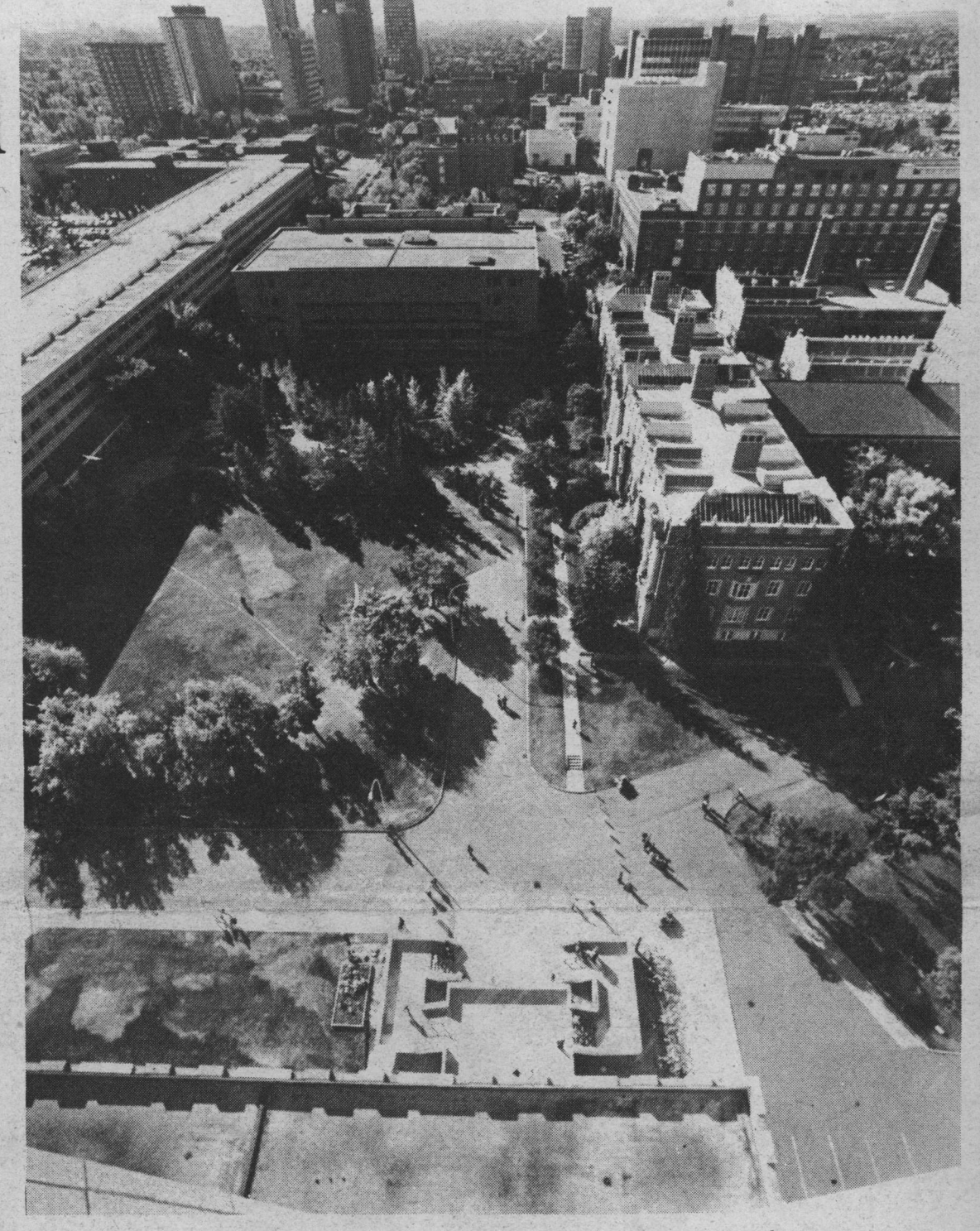
A scene from Acrophobia 201.

There's a lot of apathy and people are not tuned to the idea of conserving energy," he says.