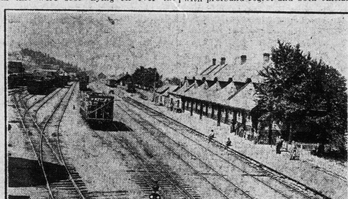
I.C. R. STATION AND YARD AT CAMPBELLTON

Carload of Goods Sent; Subscriptions Heads List With $100. Chatham, N. B., July 12-The news of