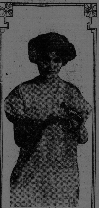
Do this daily until the back of your neck will rapidly lose its unwanted ounces of fat.

When you have slapped and pounded your neck until you are weary, you should bandage it snugly in thin rubber, and donning a high necked blouse, go merrily about your day's work or play. At the end of two hours, remove the rubber bandage and rub the flesh off with alcohol, else you may take cold.