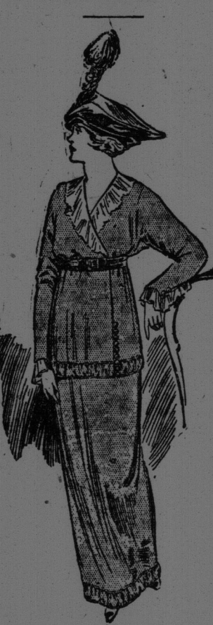
This is superior Shantung—the hem of the skirt and tunic ornamented with a bouillonnée of the same.