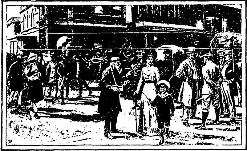
STREET SCENE IN JOHANNESBURG BEFORE THE WAR.