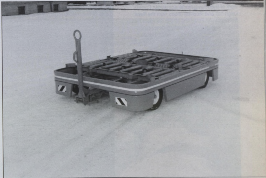
Model 85 LD-3 container dolly