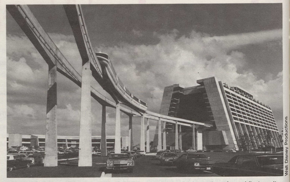
Monorail systems are recognized as viable, cost-effective alternatives for public transit.

The Disney PeopleMover train is driven by a series of computer-controlled linear induction motors that are embedded in the track to create a magnetic field which propels the vehicle. The car itself has no onboard propulsion equipment. Sensors along the track ensure that power is applied only to those motors directly under a train.