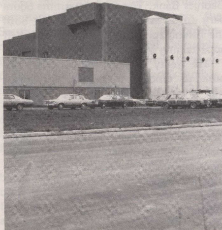
The new Sodispro plant in St. Hyacinthe.

it relieves a major pollution problem in the region of Quebec caused by the dumping of surplus by-product from cheese factories.