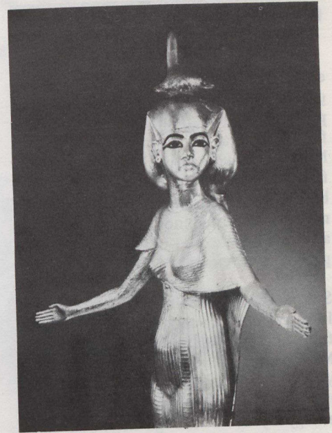
Wood statuette of the Goddess Selket.

Other great works of art and intricate jewellery include the gilded wooden statue of the Goddess Selket, Tutankhamun with a harpoon, a small gold shrine, vulture necklet and earrings. Vivid decorations abound on wooden chests and shrines which show the king at leisure, hunting or with his queen, Ankhesena-