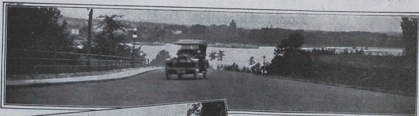
Lady Grey Road, Ottawa, Ont. Tarvia modern pavement constructed in 1911 by Ottawa Improvement Commission.