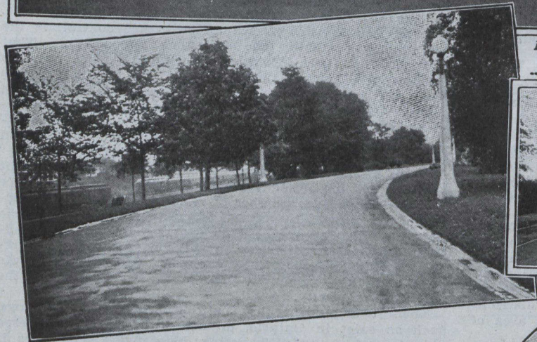
Rideau Canal Drive, Waterbound macadam road maintained with "Tarvia-B"