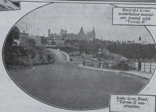
Lady Grey Road, "Tarvia-X" construction.