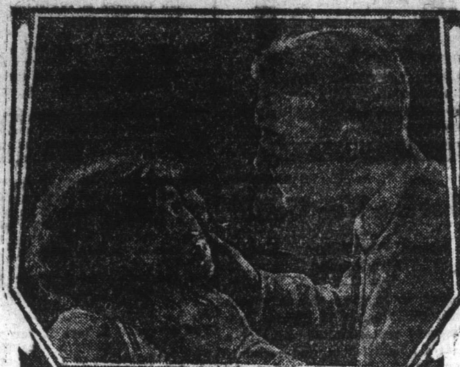
Colleen Moore and James Morrison in the Paramount Picture "The 9th Commandment"—a Cosmopolitan Production.