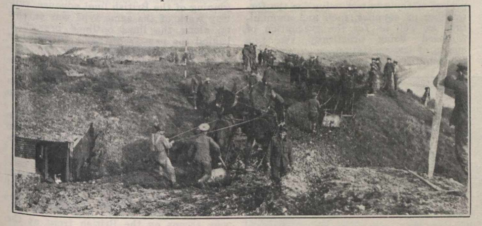
Team Outfit, grading for railway, near Canal du Nord, Nov., 1917.

amounting in all to about 70 miles of railway. In this work they were for the first time assisted by considerable