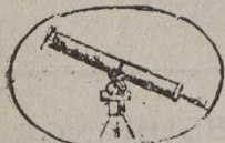
Registered Trade Mark.

Locks in all qualities for Cabinet Makers, Sash Fasteners, Locks & Brassfoundry for Builders' Ironmonger. ALL KINDS OF KEYS MADE on the PREMISES.