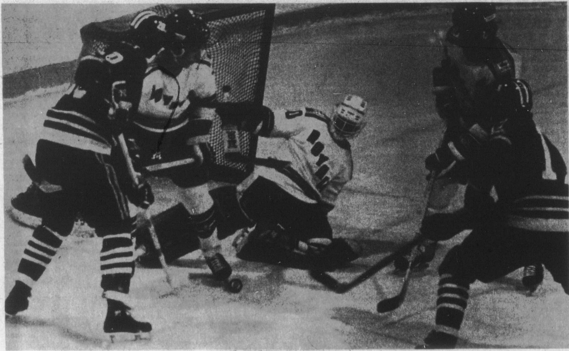
A Royal spot