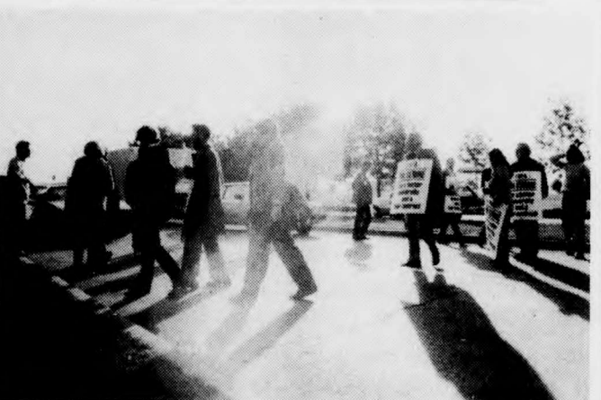
Ring around the rosie: York faculty held a strike for the first time in the University's history. They were back after two days.