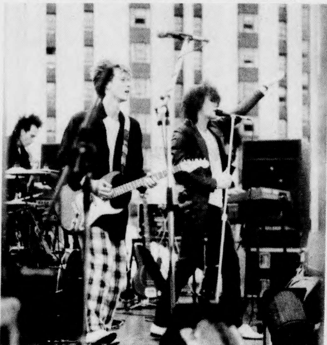
Images in Vogue: A cold and rainy orientation concert in September.

Strike strikes: YUFA hits the pickets. York's 1,100 full-time faculty and librarians go on strike for the first time in the University's history. The strike was settled after two days.