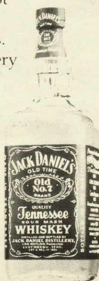
JACK DANIEL'S TENNESSEE WHISKEY