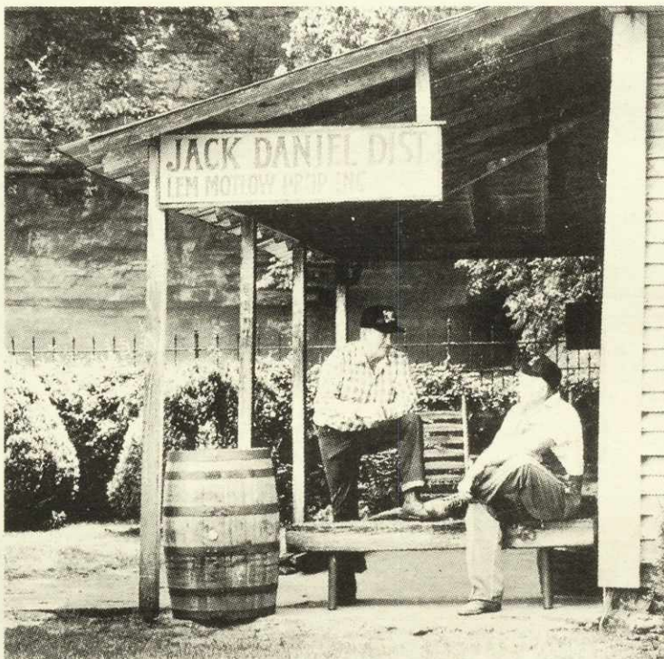
ONE OF OUR FAVOURITE SITTING PLACES is under the sign Jack Daniel and Lem Motlow put up over a century ago.

Jack Daniel settled on this very spot in 1866 and here's where he found ironfree water perfect for his needs. The spring still flows at our distillery today, not ten yards from where these gentlemen are chatting. And we still make Jack Daniel's Tennessee whiskey the way Jack and Lem once made it, drop by drop. After a sip, we believe you'll appreciate our traditional ways.