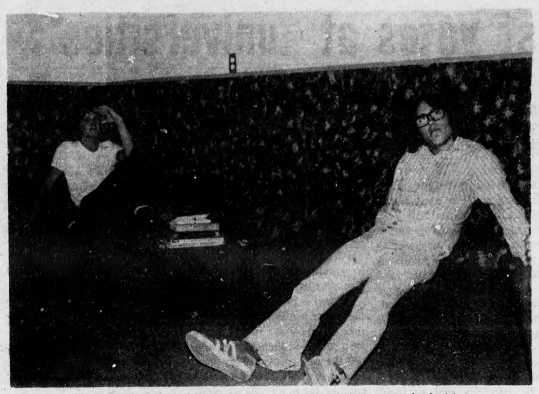
These two studious fellows are trying out the newly renevated television watching room on the second floor of the sub. As you notice it is quite a comfortable spot to take in your favorite programs.