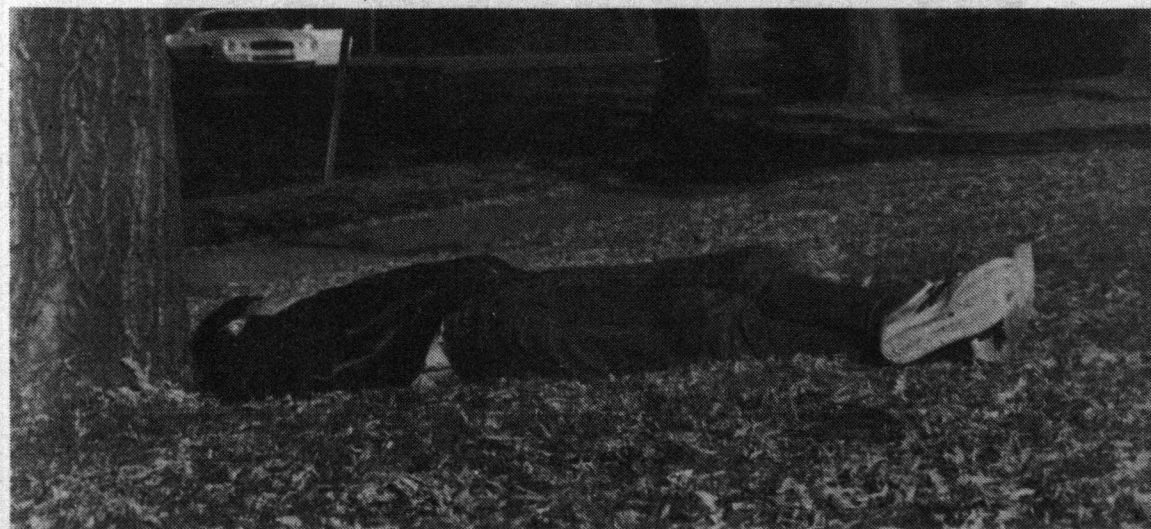
Primitive art form uncovered while raking leaves.