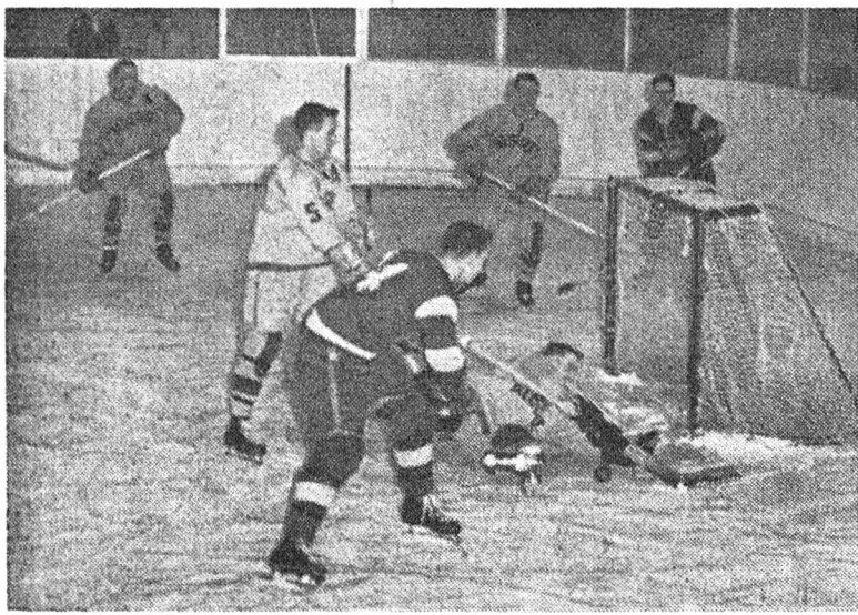
OILERS MISS ANOTHER ONE