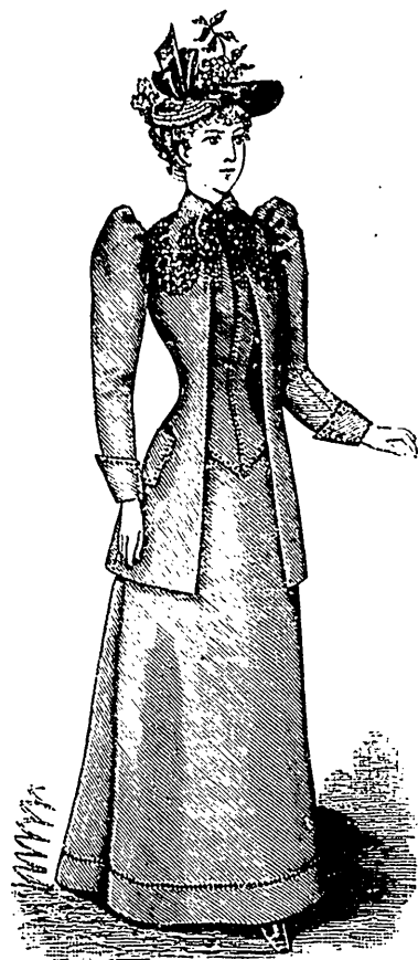
FIGURE NO. 427 T.—LADIES' TOILETTE.—This consists of Ladies' Coat-Basque No. 4439 (copyright), price 1s. 3d. or 30 cents; and Bell Skirt No. 4436 (copyright), price 1s. 6d. or 35 cents.