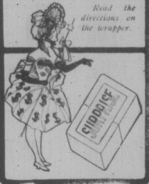
Read the directions on the wrapper.

And yet it costs no more than ordinary soaps.