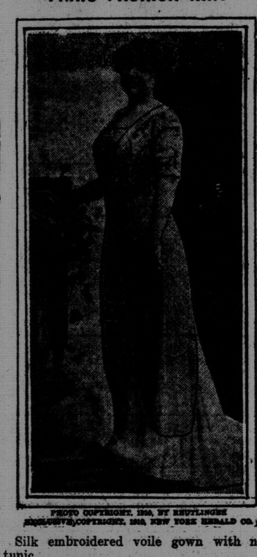
Silk embroidered voile gown with net tunic.