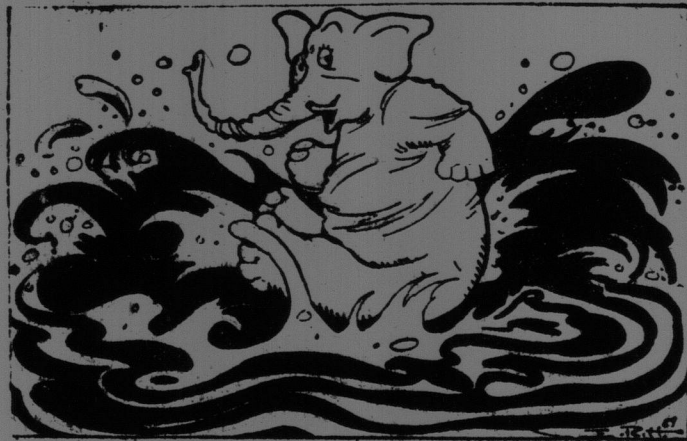
Weeny landed right in the middle of the pool.

The next thing the elephant and the twins did in the jungle playground was to slide down the sliding-board. "You go first," said Tommy Tiger to the Twins, "and Weeny can go next and I'll go last. It's lots of fun for it has so many bumps on it."