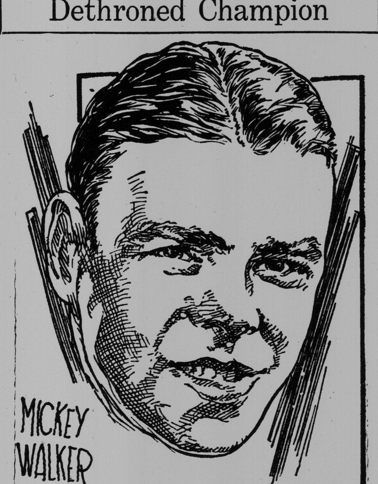
Above, "Mickey" Walker, who lost his welterweight title in a close decision last night to Pete Latzo.