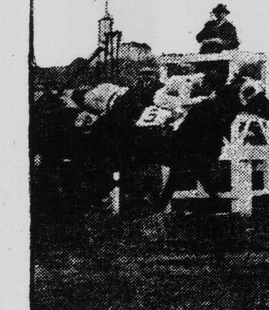
Photo shows "Fair Star," No. 21, with Bourassa up, running neck and neck with "Japan" at the finish of the seventh annual running of the Pimlico Futurity at Pimlico Race Track, Maryland. "Fair Star" flashed home a winner, getting $68,160 for the stable and defeating 15 of the best juveniles.