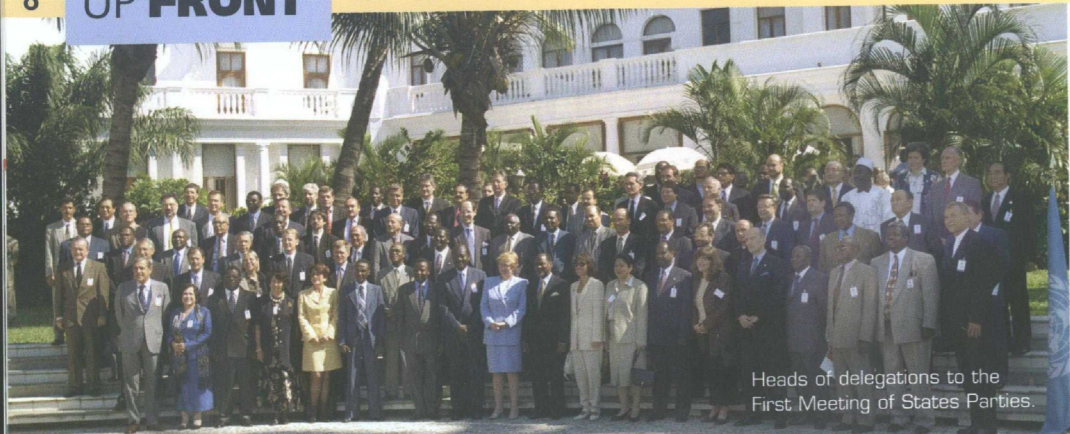
Heads of delegations to the First Meeting of States Parties.